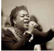
30th Annual Harvest Gospel Concert Series