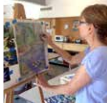
East End Arts School Visual Arts Programs