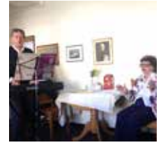
Music by the Bedside