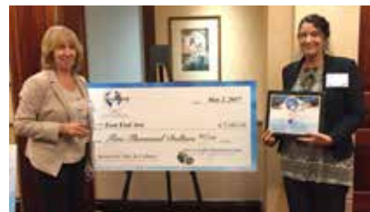
Long Island Imagine Awards: Arts & Culture Award Winner