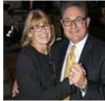
ARTworks Spring Gala