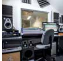
NEW Recording Studio