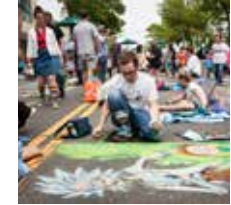
21st Annual Community Mosaic Street Painting Festival

NEW Art Barre: Dance, Music, Visual Arts, Wine Event Series with Peconic Ballet Theatre