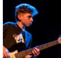
East End Arts School Music Programs