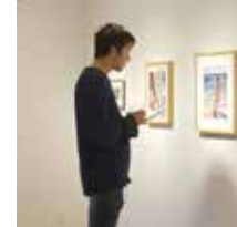
East End Arts Gallery Exhibitions