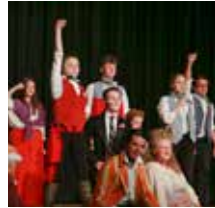
15th Annual Teeny Awards